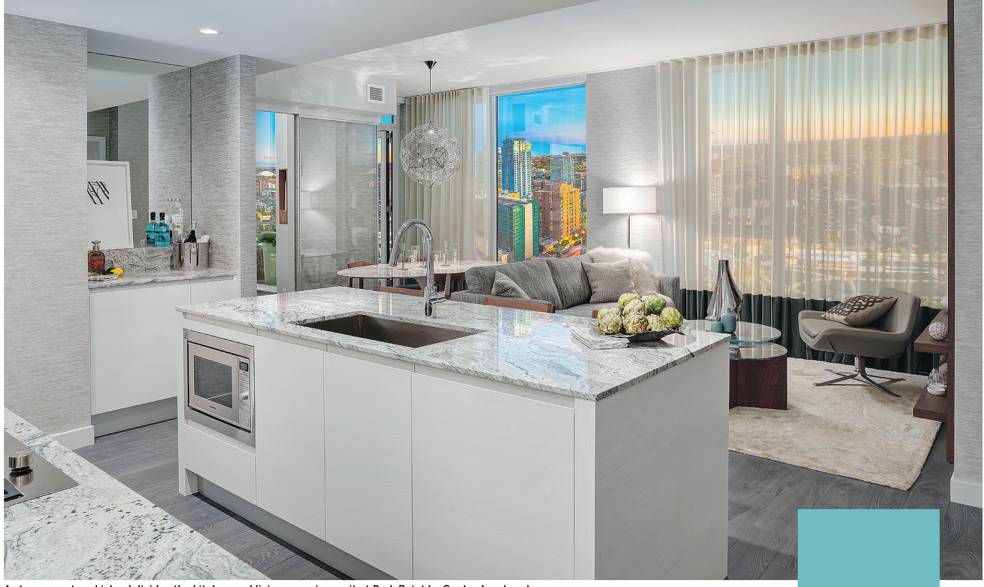
A stone-countered island divides the kitchen and living room in a unit at Park Point by Qualex-Landmark.