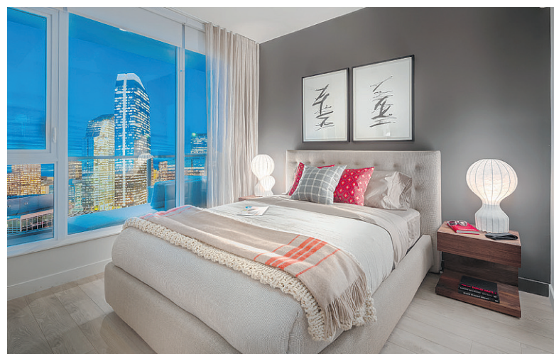
A floor-to-ceiling window provides lots of light in the master bedroom.

With the recent unveiling of Park Point's Discovery Centre, located just a few blocks from the project on 11th Avenue and 3rd Street S.W., buyers can get an idea of exactly what their new home will look like. The centre showcases two show suites: plan 01, a 560-squarefoot, one-bedroom home with a 108-square-foot terrace; and plan